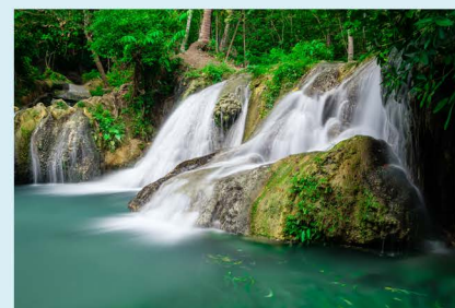
Hagimit Falls in Davao Del Norte