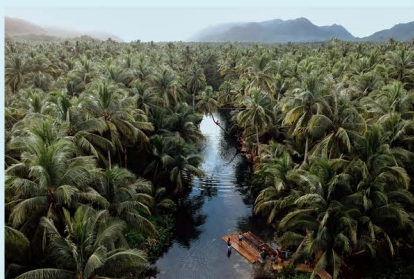
Maasin River, Siargao

While the Philippines experiences annual typhoons during its distinct rainy season, there's always a sunny spot somewhere on its 7,600+ islands! Being aware of this helps travellers plan better around the weather patterns. Earthquakes can also occur in the Philippines. Rest assured, our team is always updated on any warnings or forecasts. We have robust safety protocols and a crisis management plan to handle emergencies and minimise disruption.