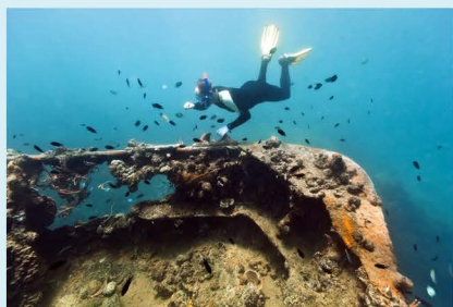
Shipwrecks turned into reefs in Coron