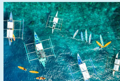
"Bangka", also known as Filipino boats

By Land: Navigating the islands by land is straightforward, thanks to national highways and an extensive public transportation network. The jeepney, a colourful symbol of Philippine culture, is the most popular mode of transport, alongside cabs, buses, tricycles, and even trains in urban areas. In some cities, you can also enjoy a ride in a calesa, a traditional horse-drawn carriage.