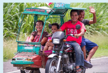
A common mode of transportation in the Philippines: the Tricycle

With so much diversity, your clients will be spoiled for choice when planning their trip. In our sales guide, we'll help you navigate the options—whether it's finding the perfect island for each traveller, tips on island-hopping, or insider advice on crafting the ultimate dream trip to the Philippines.