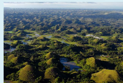
Chocolate Hills with up to 1776 hills