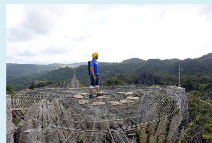
Viewing platform in Masungi Georeserve

Jona also recommends the Masungi Geo Reserve , known for its unique geological formations. "Adrenaline junkies will love walking across the floating net 'Sapot', climbing the highest peak 'Tatay', or tackling suspension bridges and rope courses. A special highlight is the 'Duyan', a massive hammock spanning several hundred metres that offers breathtaking views of the surrounding landscape."