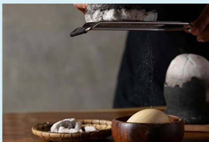
Dessert with traditional "Asin (Salt) Tibuok" at Toyo Eatery

Manila is also home to some top-notch dining spots. Gregor's recommendations include: