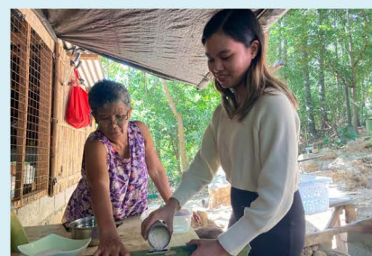
A woman from the Aeta community teaching traditional cooking techniques