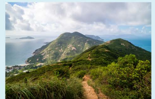
A hiking trail in Dragon's Back Mountain