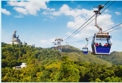
Ngong Ping Cable Car with a 360° view of the surrounding nature

H ong Kong captivates travellers worldwide with its remarkable fusion of tradition and modernity. As a key hub in Asia, the city boasts over 1,100 daily flights connecting it to around 220 global destinations. Its proximity to Macau and major Chinese cities, accessible via high-speed rail, makes it a gateway to the region.