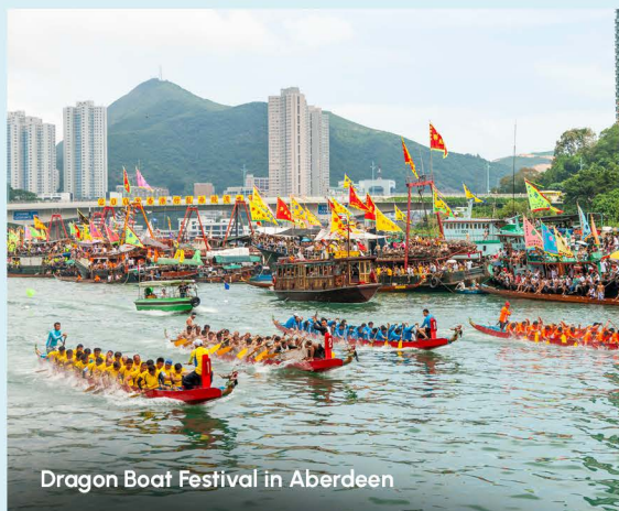
Dragon Boat Festival in Aberdeen

For a taste of tranquility, one can hop on a boat to one of Hong Kong's outlying islands like Cheung Chau or Lamma Island . These serene islands offer a refreshing escape from the urban hustle and bustle, with stunning seafood and laid-back village vibes. Nature lovers shouldn't miss the Hong Kong Wetland Park , a conservation and education centre that highlights the rich biodiversity of the city's wetland ecosystem — a true haven for wildlife enthusiasts.