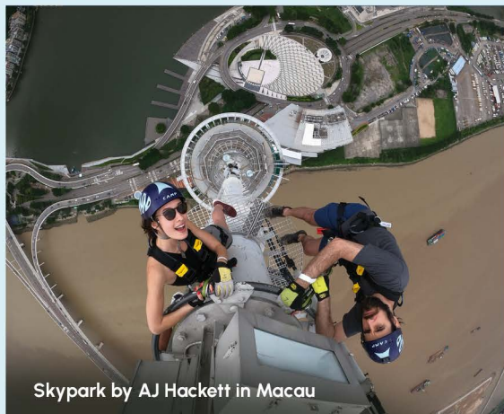
Skypark by AJ Hackett in Macau