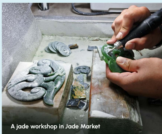
A jade workshop in Jade Market