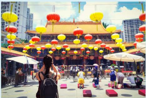
Wong Tai Sin, a multi-religion temple