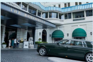
Peninsula Hotel with its signature Rolls-Royce