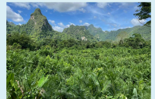
A jungle in Phang Nga

F or thrill-seekers, Khun Kallaya has the perfect suggestion: "A jungle trek in Phang Nga is an absolute must for adventurers. Unspoiled nature, rich biodiversity, and hidden waterfalls make for an exhilarating day filled with surprises!"