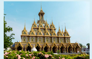
A gold-plated temple complex from the Ayutthaya period

K hun Pornpavee, our cultural connoisseur, says: "Visiting a remote temple at sunrise is always a magical experience for me. There are so many hidden temples where you can soak in the serenity all by yourself. The peaceful quiet, combined with the golden rays of sunlight illuminating the temple, creates unforgettable moments."