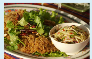
Yam Pla Dook Foo

Encourage your guests to dive into the vibrant world of Thai cuisine and step outside their comfort zone to try something new. Skipping the classic Pad Thai for a bold, exotic dish might just be the highlight of their trip!