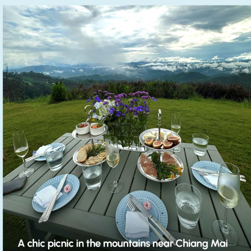
A chic picnic in the mountains near Chiang Mai

The South is known for its coconut-based dishes and abundant seafood. Don't forget to try Thailand's array of exotic fruits like pomelo, jackfruit, and the infamous (but truly delicious) durian!