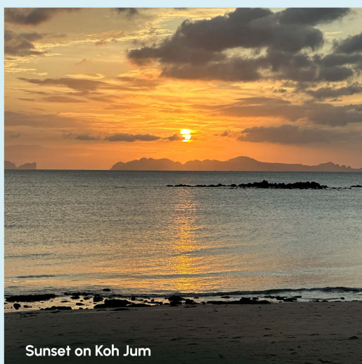
Sunset on Koh Jum

For those seeking hidden gems, Northern Thailand offers a wealth of lesser-visited sites. From ancient architectural marvels dating back to the 13th century, to idyllic green landscapes, these areas reveal a Thailand many have yet to discover. Travellers can immerse in rich culture and enjoy meaningful encounters with the hospitable locals, gaining true insight into daily life.