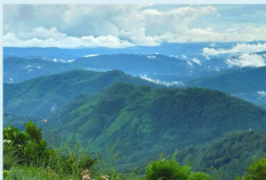
A mountain range in northern Thailand

O ur nature enthusiast, Khun Pradthana, loves exploring northern Thailand: "Standing barefoot in the grass in Chiang Rai, breathing in the crisp air, and gazing out over the rolling hills towards the mountains of Myanmar is a truly breathtaking experience. Northern Thailand's natural beauty is like no other."