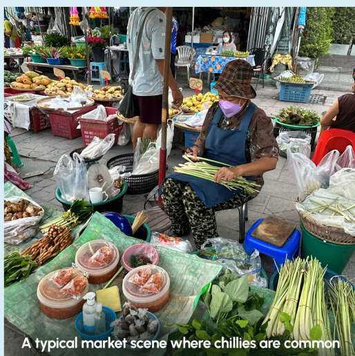
A typical market scene where chillies are common

Families can enjoy renting a house along the peaceful Kanchanaburi River, surrounded by nature and local attractions. For travellers seeking a cultural experience, small resorts in Northern Thailand offer personalised service and unique excursions in off-grid destinations. Older travellers may prefer the calm and charm of Hua Hin or Chiang Mai, where culture, relaxation, and light activities come together.