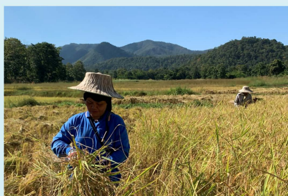
Farmer in Nan

S awasdee Kha! Imagine offering your customers not just a trip, but an unforgettable experience. Thailand, a country many think they know, still holds countless secrets and surprises, even for seasoned travellers and repeat visitors.