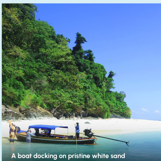
A boat docking on pristine white sand

Another insider tip is Koh Jum near Krabi, ideal for families and couples who want to unwind on unspoilt beaches, far from the bustling tourist areas.