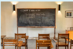
Learning Thai right at the hotel